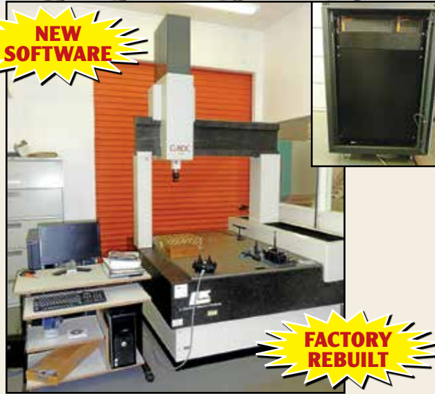
LK CINCINNATI Axiom CNC CMM , Mdl. G80C, 72" x 48" Table, w/Renshaw PH10T probe and probe changer, additional Renshaw PH9 probe, w/2013 Nikon Camio 8.0 SPI software and Windows 7, SN G80C/9104, factory rebuilt 2007.