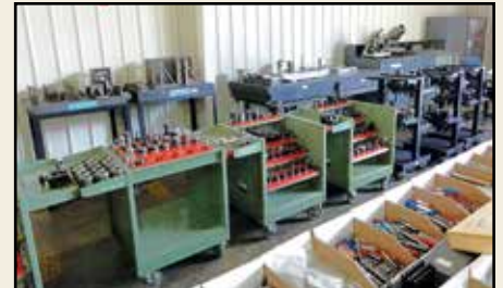
Machine Tooling. Perishable Tooling.

SKAT BLAST Sand Blast Cabinet, 48" x 30". ENCO Belt Sander/Grinder, Mdl. 93645, 6" x 48" belt, 6" x 5-7/8" wheel, 12" x 1" grinding cloth, 1 HP, 5,000 SFPM, 60 cycle, 3,450 RPM. WILTON Double Pedestal Grinder, Mdl. 161, 8" wheel, 3/4 HP, 3,450 RPM. WILTON Bench Grinder, 6" belt. Die Lift Cart, 750 KG.