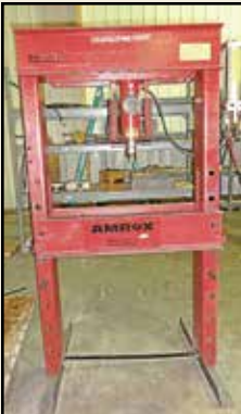
AMROX 50-Ton H-Frame Press, hydraulic.