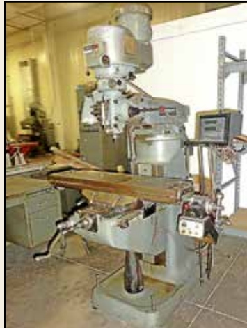
BRIDGEPORT Vertical Mill , Mdl. Series I, 9" x 42" table, VS, 2 HP, PF@X, w/Newall Sapphire 2-axis DRO, SN 240796.