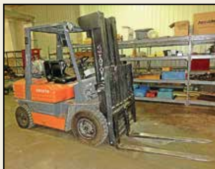
TOYOTA Forklift , Mdl. 5FG25, 4,300-lb. cap., LP gas, SS, 3-stage mast, 188" lift, all-terrain pneumatic tires, 48" forks, SN 80121.