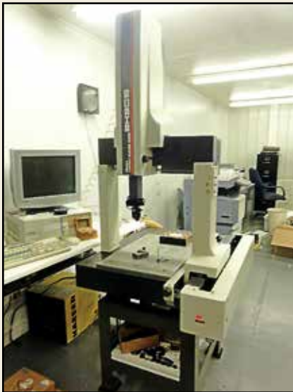
< MITUTOYO CMM , Mdl. BH305, 34" x 20" table, w/Renshaw MIP probe, w/Geo Pak 2000 software, SN 97030005.

Inspection: Wednesday November 12 9:00 A.M. – 4:00 P.M.