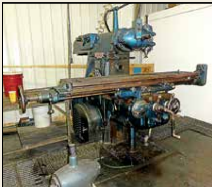
< KEARNEY & TRACKER Horizontal/Vertical Mill , Mdl. 4CH, 15.5" x 75" table, 15 HP, SN N/A.