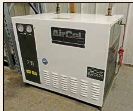
AIR CEL SYSTEMS Air Dryer , Mdl. AR-75-48, 200 max. PSI, 75 CFM, SN RITEG11044.