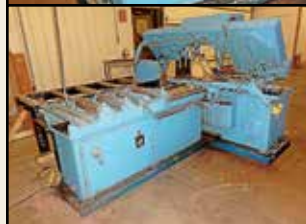
DoALL Horizontal Bandsaw , Mdl. C1216A, automatic power feed, 12" x 16" cap., VS, 85-450 FPM, 5 HP, 48" discharge table, 18" x 10' roller conveyor table, SN 423-84124, 1984.