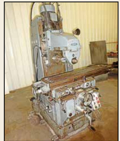
OKK Horizontal Mill , Mdl. MH-2P, 12" x 51.5" table, w/vertical head, SN 2271.

Many Items Not Pictured – See it all at: www.stoneauctioneers.com