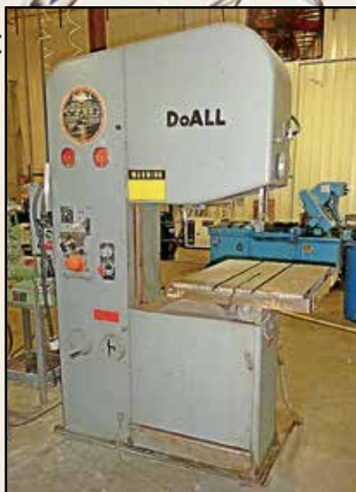
DoALL Vertical Bandsaw , Mdl. 2613-1H, 24" x 30" table, 14" under, 27" throat, w/blade welder, SN 361-79219, 1979.