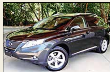
2010 LEXUS RX350 SUV , 28,822 miles, New Tires!

Directions, Auction Terms & Conditions Available at www.stoneauctioneers.com