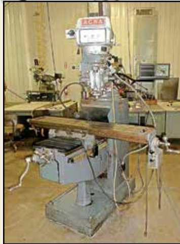
ACRA Vertical Mill , Mdl. CK 1-1/2 HK, 10" x 54" table, VS, 3 HP, power draw bar, PF@X, w/Mitutoyo 2-axis DRO, SN 771383.