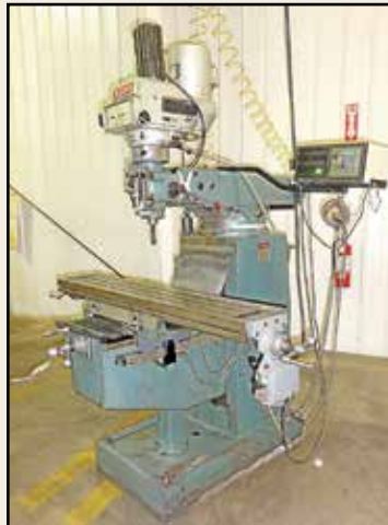
ACRA Vertical Mill , Mdl. CK 1-1/2 HK, 10" x 54" table, VS, 3 HP, power draw bar, PF@X, w/Mitutoyo 2-axis DRO, SN 771373.