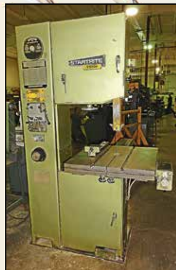
STARTRITE Vertical Bandsaw , Mdl. V500H, 28" x 28" table, 14" under, 20" throat, 15" cut under, SN S6B03.