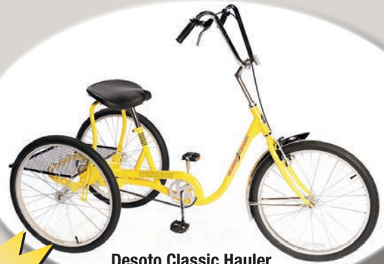
Desoto Classic Hauler