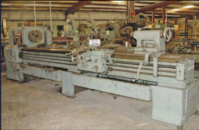
LEBLOND REGAL Engine Lathe , 21" x 120", threading, cross slide, 15" 4-jaw chuck, steady rest, tailstock, 10 hp., s/n 2F550.