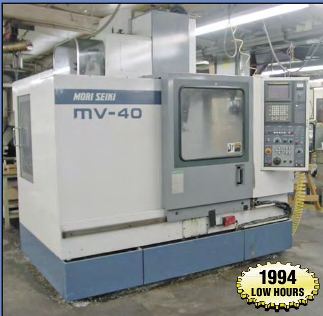
MORI SEIKI Mdl. MV40B Vertical Machining Center , travel 31.4" x 16.1" x 20", 40 taper, MF-M6 controls, 20 ATC, 15 hp., 4th axis compatible, s/n 003499, cutting time 817 hrs., power on time 26,725 hrs., 1994.