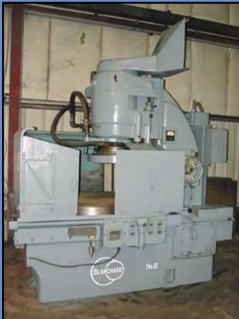
BLANCHARD Mdl. 18 Rotary Surface Grinder, 42" magnetic chuck, 50 hp., s/n 8758.