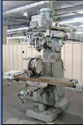
BRIDGEPORT 9" x 42" Vertical Mill, SP, 2-axis DRO, s/n 131811.