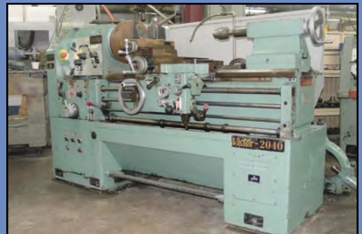
VICTOR Mdl. 2040 Engine Lathe, 20" x 40" threading, 3.25" spindle bore, 12" 3-jaw chuck, steady rest, 5 hp., s/n 760192.