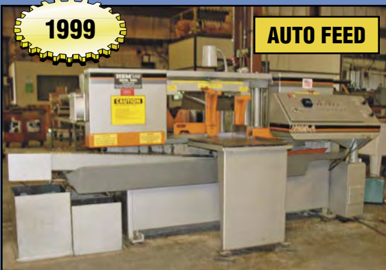
HE&M Mdl. H105-A Automatic Horizontal Band Saw , 14" x 16" cap., chip auger, power blade tension, auto feed, w/20' runout roller conveyor, s/n 653499, 1999.