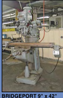
BRIDGEPORT 9" x 42" Vertical Mill, VS, 2-axis DRO, power feed at X, s/n 214811.