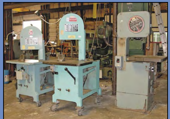
DoALL Mdl. 16-M Vertical Band Saw , 24" x 24" x 10", s/n 13459187; Roll-In Band Saw , 30.5" x 18" x 15"; Roll-In Band Saw , 18.5" x 19.5" x 10".