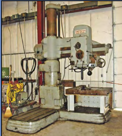
AMERICAN Hole Wizard C1-32-20-02 Radial Arm Drill , double pedestal base, 33" x 48" shop made box table, 13" column, 4' arm, 5 hp.