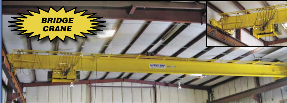
PROSERVE Bridge Crane , 60' span, single girder, top running, w/Shepard Niles 10-ton underslung hoist, 110' of rail, pendulum controls.