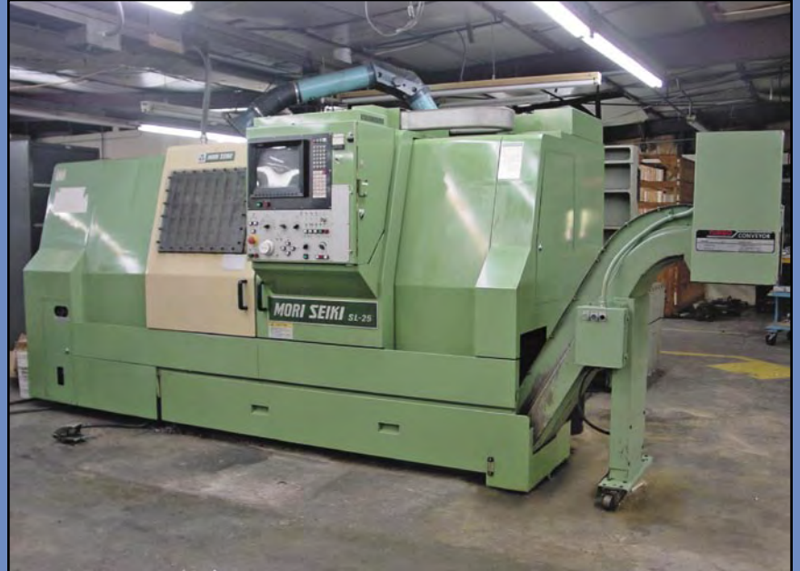
MORI SEIKI Mdl. SL25/500 Lathe , 20.5" x 24.6" bed, X=6.3", Y=24.6", 20 hp., w/chip conveyor, 13.7" cross slide, 40" centers, 20 hp., 6-station turret, programmable tailstock, MY-T3 control, auto. cutting time 5,248 hrs., power on time 31,024 hrs., 1987.