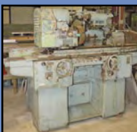
CINCINNATI Mdl. 1024 Universal Grinder, 10" x 24" x 13" wheel cap., w/ID attachment, 5 hp.