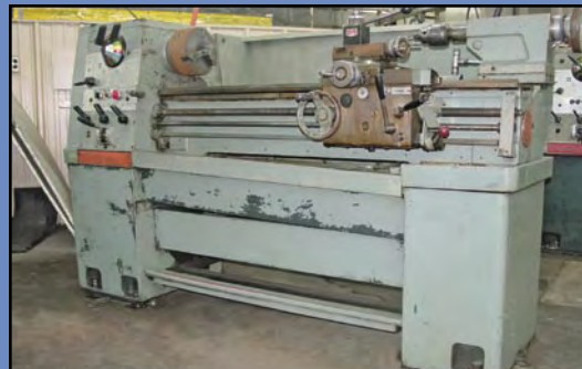
CLAUSING COLCHESTER Engine Lathe, 13" x 40", threading, collet closer, tailstock, 8" 3-jaw chuck, 10 hp., s/n 5/0014/04613.