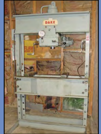
DAKE Mdl. 5-076 Hydraulic H-Frame Press , 75-ton cap., s/n 162688.