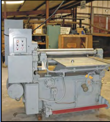
NIAGARA Mdl. 5-36 Plate Roll , 36" x 3/16" cap., 30" x 20" work table, s/n 57221.