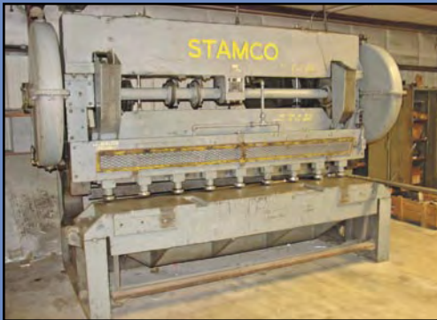
STAMCO Mechanical Shear , 8' x 3/16" cap., 4' squaring arm, ROBG, s/n L7651.