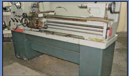
CLAUSING COLCHESTER Engine Lathe, 13" x 40", threading, collet closer, tailstock, 10 hp., s/n 5/004/2837DD.