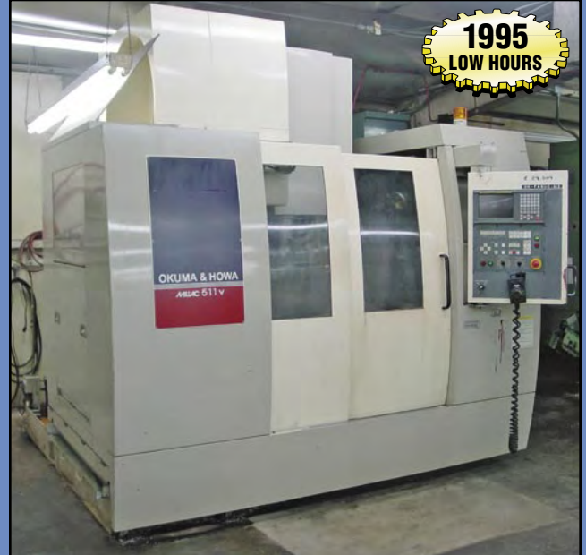
OKUMA & HOWA Mdl. Millac511 Vertical Machining Center , travel 40" x 20" x 20.47", Fanuc 18M controls, 40 taper, 20 ATC, 10,000 RPM, 25 hp., 4th axis compatible, s/n 5075, cutting time 1,436 hrs., power on time 20,818 hrs., 1995.

A Major Producer of Space Shuttle Components SanTek Engineering Inc.