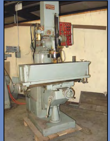
EX-CELL-O CORP. Elox Mdl. 242 EDM , 19" x 38" tank, 30" x 7' work surface.