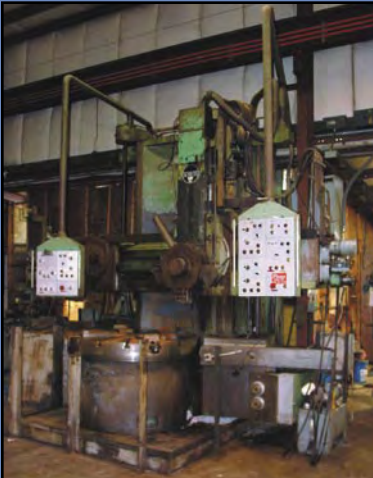
SCHIESS Vertical Turret Lathe , 52" cap., pendulum controls, dual head (1 head broken), 90 hp., s/n 32733404.