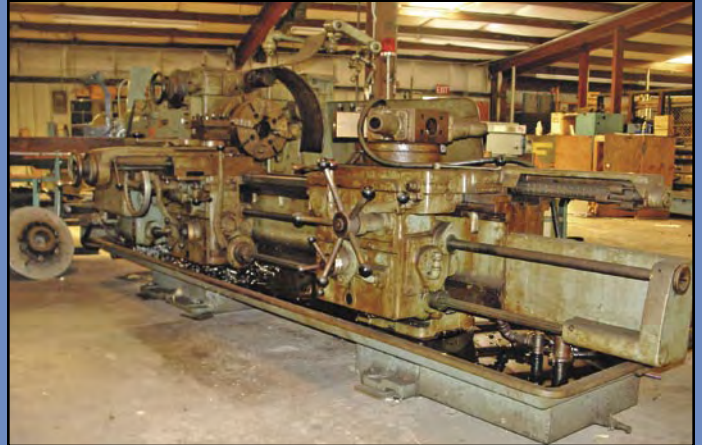
GISHOLT No. 3 Turret Lathe , 22" swing x 81" bed length, 6-station turret, 16" 3-jaw chuck, 25 HP, s/n 315-X9.