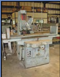
< DURA-PLANE Mdl. 5817 Horizontal Surface Grinder, 24" x 8" magnetic chuck, s/n 1002.