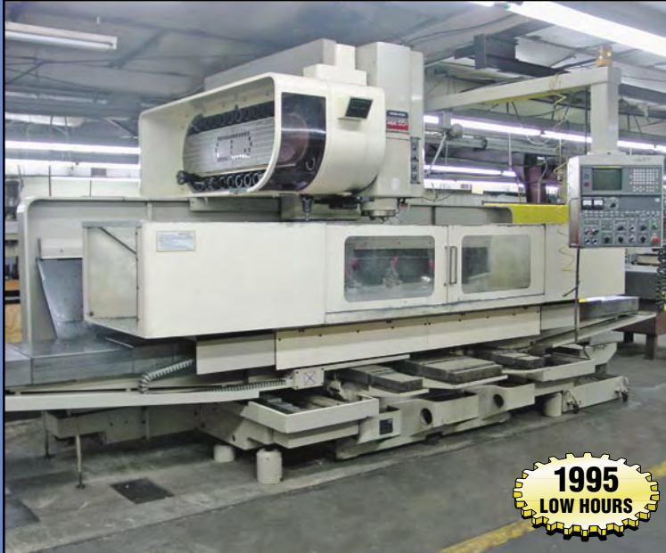
OKUMA & HOWA Mdl. Millac65V Vertical Machining Center , travel 22.83" x 25.59" x 78.74", Fanuc 16M controls, 50 taper, 30 ATC, chip conveyor, 25 hp., 4th axis compatible, s/n 66884, cutting time 1,629.46 hrs., power on time 20,892 hrs., 1995.

MAJORITY OF MATERIAL USED ON THESE CNC MACHINES HAS BEEN ALUMINUM