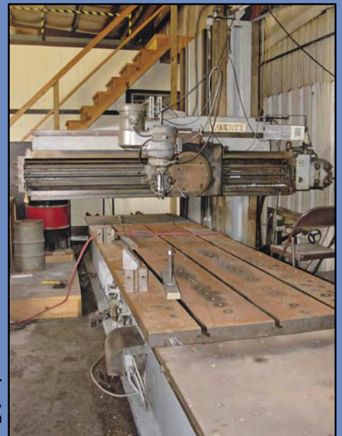
> LIBERTY Horizontal Planer Mill , 10' x 58" table, 44" travel, 24' bed travel, 94" horizontal head travel, 2-axis DRO, s/n J-01050281280, Bridgeport-style converted head, variable speed.