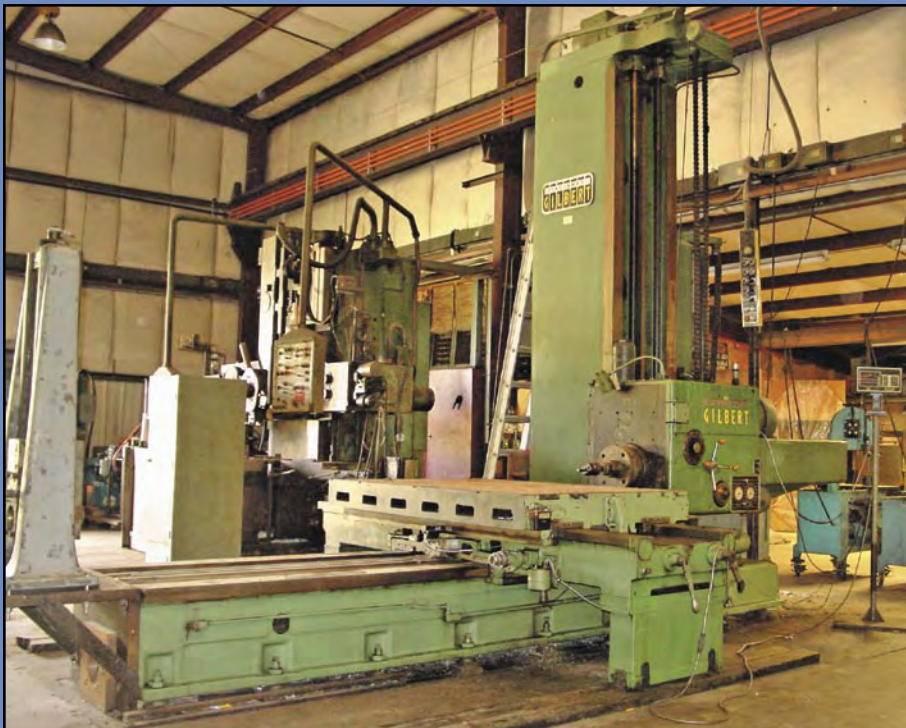
< CINCINNATI GILBERT Horizontal Boring Mill , 5" spindle bore, 48" x 72" table, 60" x 8' travel, 120" bed, auto positioning, 36" travel bar, 20 hp., s/n J59, 1957.