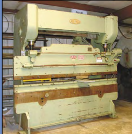
CHICAGO Mdl. 6L-8 Mechanical Press Brake , 8', 2.5" ram, ROBG, 78" BH, s/n L7651.