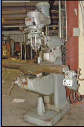
BRIDGEPORT 9" x 42" Vertical Mill, VS, power feed at X, s/n 215195.