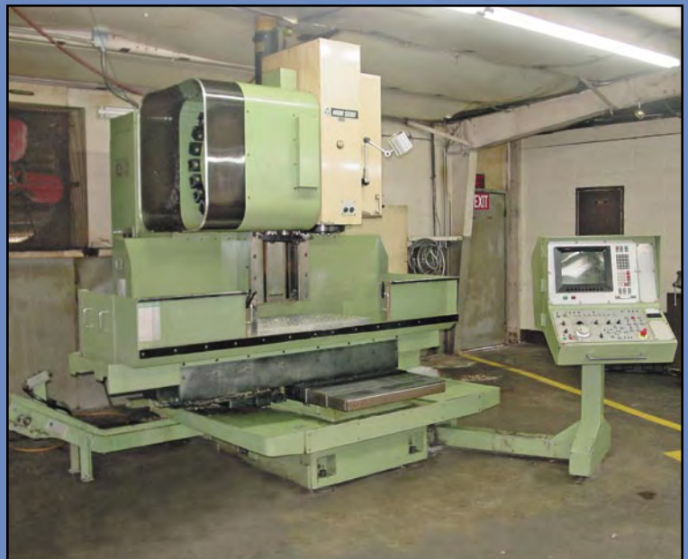
MORI-SEIKI Mdl. 45/40 Vertical Machining Center , travel 23.6" x 18.1" x 20.1", Fanuc MRC 1 controls, 40 taper, chip conveyor, 20 ATC, 15 hp., 1984.