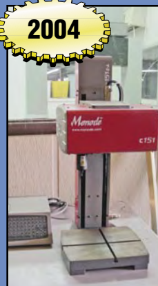
MONODE Mdl. C151 ZA Engraver , 2004