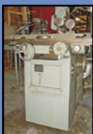
CINCINNATI Tool and Cutter Grinder.