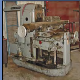
FRITZ-WERNER 4" x 63" Horizontal Mill, 10 hp., s/n 2212.