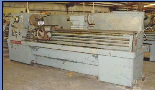
CLAUSING COLCHESTER Gap Bed Engine Lathe, 17" x 80", threading, taper attachment, tailstock, 16" 4-jaw chuck, 10 hp., s/n 7/00/8/06875.