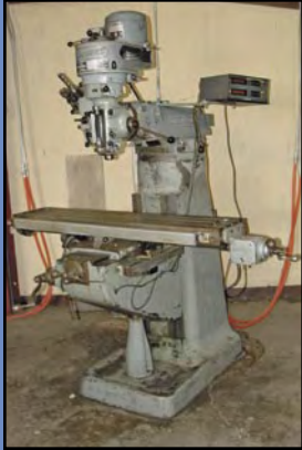
BRIDGEPORT 9" x 42" Vertical Mill, SP, w/Mitutoyo 2-axis DRO, s/n 80167.