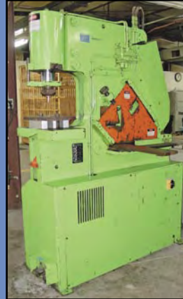
MUBEA Mdl. HIW66 Ironworker , 50-ton cap., s/n 00150208066807.