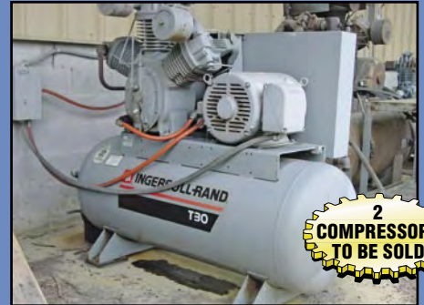
INGERSOLL-RAND Mdl. 30T Air Compressor , 2-stage, s/n 781093.