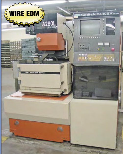
SODICK Mdl. A280L Wire EDM, Mark EXEDW controls, 20" x 30" tank capacity, travels 12" x 8" x 6.7", 1990.

MAJORITY OF MATERIAL USED ON THESE CNC MACHINES HAS BEEN ALUMINUM