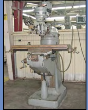
BRIDGEPORT Vertical 9" x 42" Mill, VS, 2-axis DRO, power feed at X, s/n 197984, Bridgeport shaping attachment, s/n E6447.