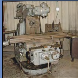
CINCINNATI No. 3 Horizontal Mill, w/vertical head attachment, 16" x 65" table, 7.5 hp., s/n 4J3T1Z-2.